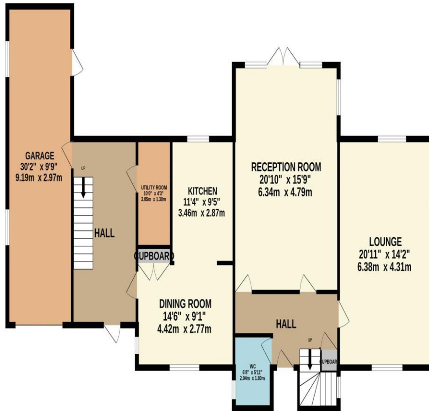
GROUND FLOOR 1530 sq.ft. (142.1 sq.m.) approx.